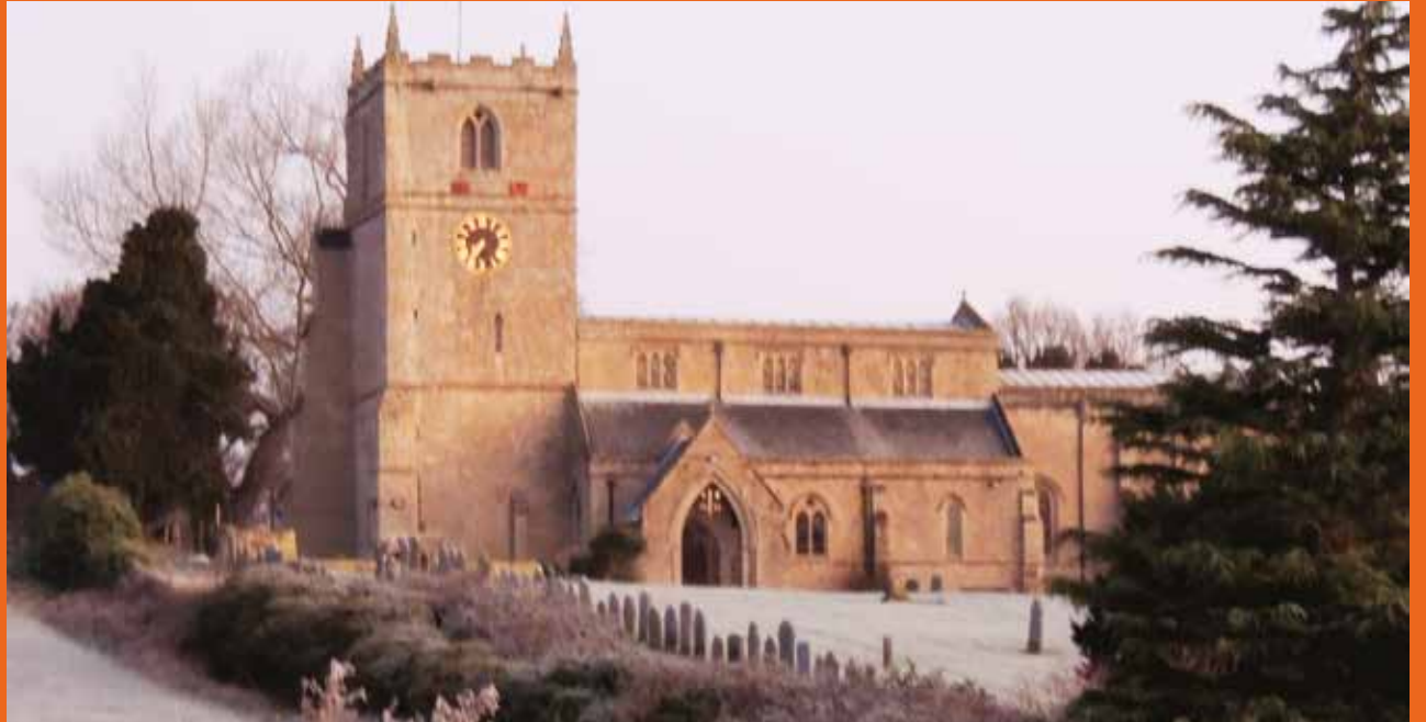
Warsop Church on a beautiful, frosty December morning