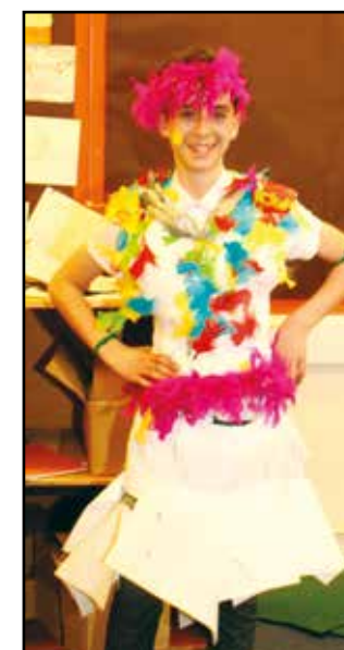
Pictured above and far left are some of the students modeling the outfits their teams made.