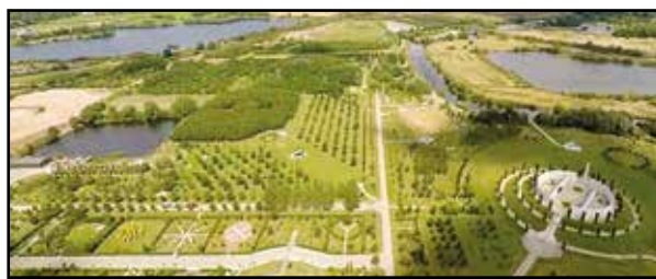
The National Memorial Arboretum at Alrewas, Staffordshire