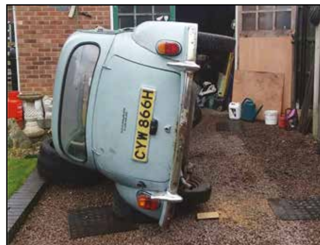
Moggie #2 "Elaine" 1970

The charities they decided on (in addition to Coolearth, the official charity of the rally) were UNICEF, Mind and Cancer Research UK. The route that they have chosen for the outbound journey is known as 'the southern route' in Mongol Rally lore, and will see them traverse over twenty countries, and includes the infamous Pamir Highway in eastern and central Asia, crossing the Gobi desert and convoying through Iran. They are travelling 'the northern route' on the return journey which sends them into the depths of Russian Siberia.