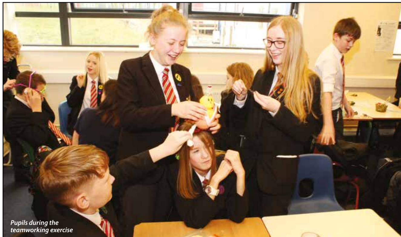
Pupils during the teamworking exercise