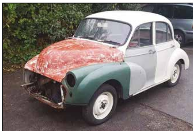
Moggie #1 "Georgina" 1964

We continue to urge people to donate to our causes and continue to hold fund raising events including bake sales, head shaving and chest waxing! Please visit our pages and donate to this amazing cause! See donation page links opposite.