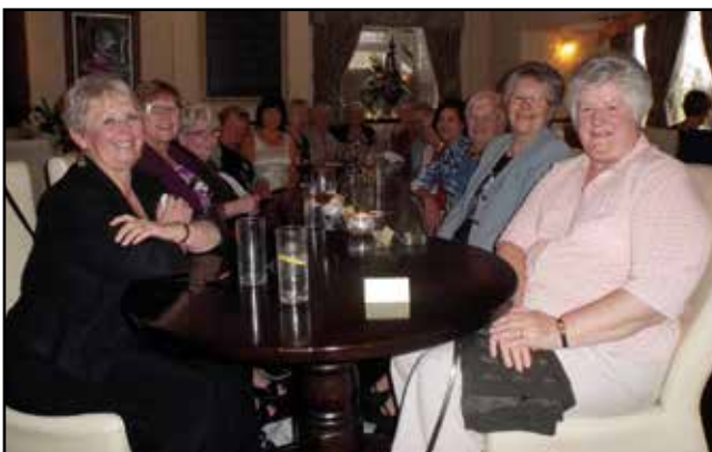
Members enjoying the event.