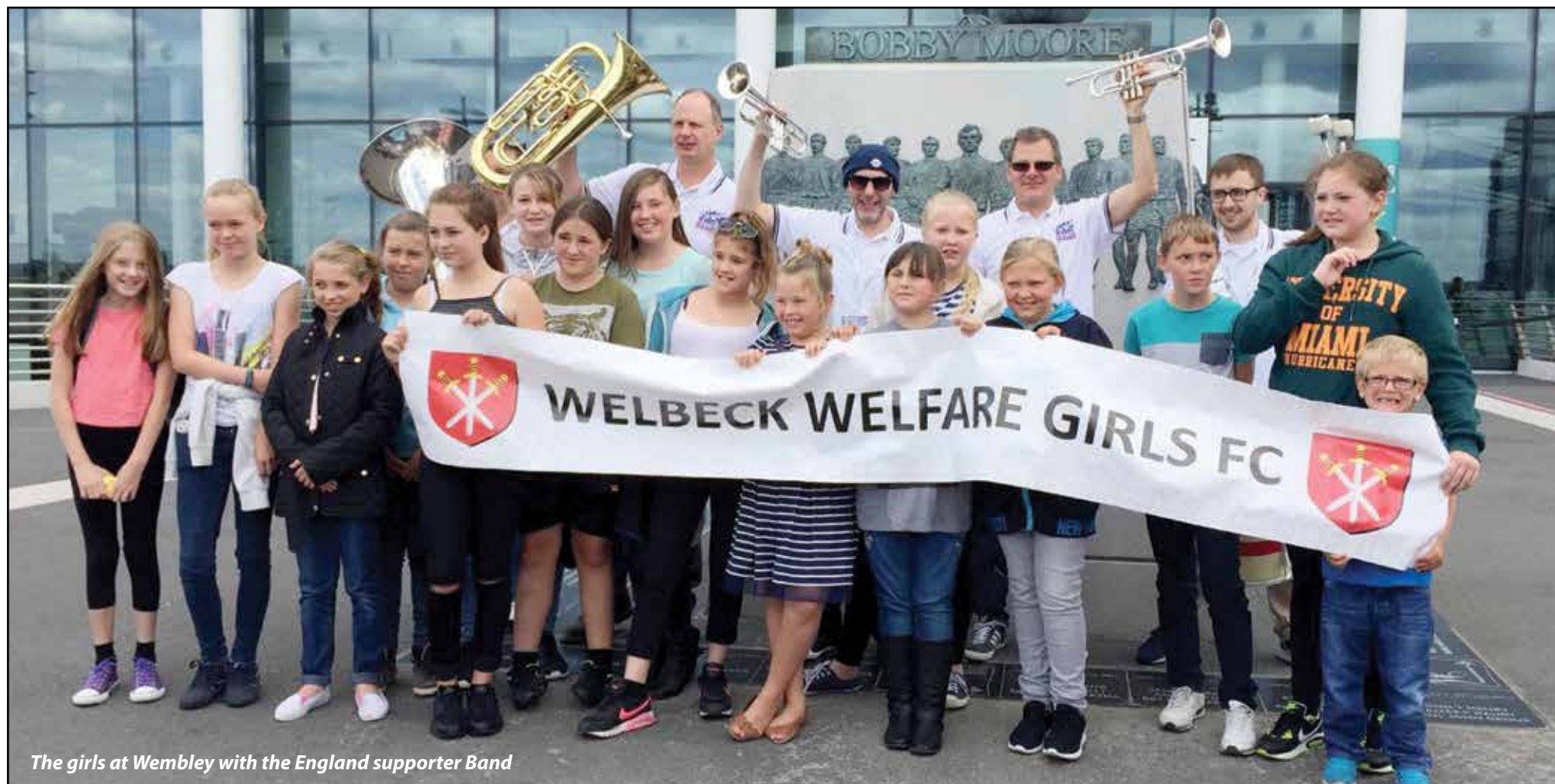
The girls at Wembley with the England supporter Band