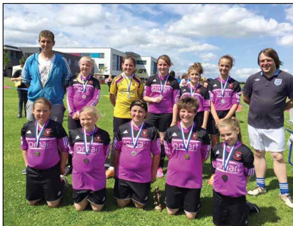
U14's winners at Shirebrook Academy Fun day