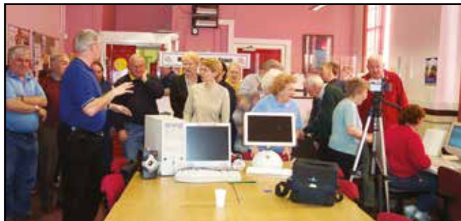
Investment in new equipment to keep Infotech up-to-date.