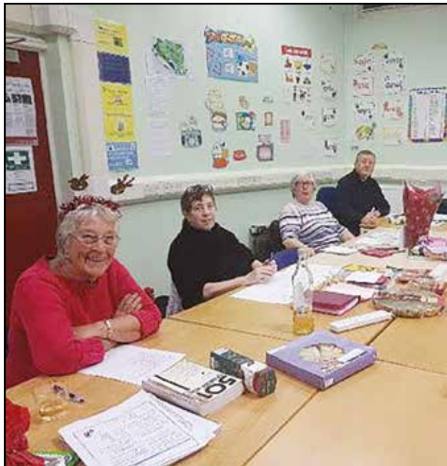
Infotech Spanish Course.