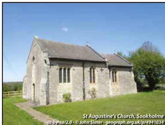
St Augustine's Church, Sookholme